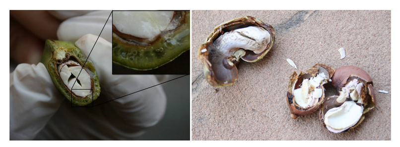
Fig. 1. Sagittal section of a fresh cashew nut (left); note the white kernel and in the close-up the spongy mesocarp whose tubules contain the CNSL. Cracked dry cashew nuts with the tough mesocarp containing caustic resin (right).

Cashew nuts are high in energy. One hundred grams of cashew kernels collected in FBV correspond to 580 Kcal distributed in a balanced manner across carbohydrates, fat, and protein (value calculated from Peternelli [2015]). Moreover, the cashew kernel contains all the essential amino acids in the right proportions, and the United States Department of Agriculture considers cashews a food of choice for humans [USDA, 2015]. Therefore, we assume that cashews are a food of choice for other omnivorous primates, including capuchin monkeys.