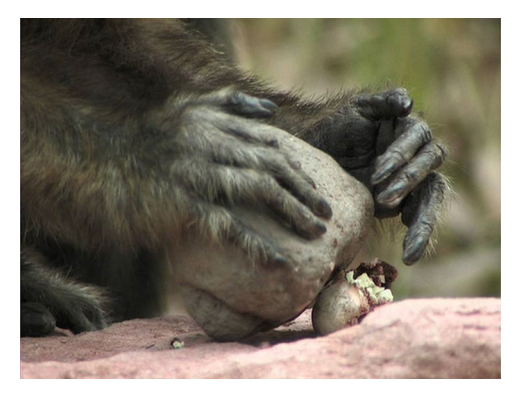
Fig. 4. An adult male uses a stone to crack a dry cashew nut.

(187 episodes out of 236); when capuchins did not use a tool, they succeeded in 61% of the episodes (148 episodes of the 241).