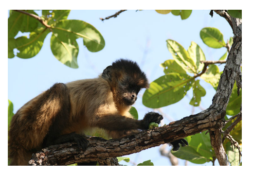
Fig. 3. An adult female is rubbing a fresh cashew nut on the bark of a cashew branch.