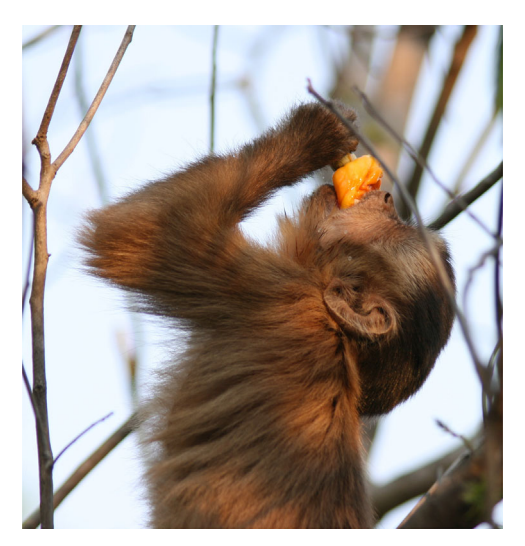
Fig. 2. A young capuchin (S.\ libidinosus) is sucking the cashew apple with his head backward.

Success with fresh nuts was achieved in 87% of the episodes (Table IIIb) and until 1 year of age individuals never succeeded (Fig. 5b). All behaviors were performed: some very often (e.g., rubbing, processing with teeth, and extracting with fingers; [Fig. 3]; see Supplemental Material S2, S3, S5), and some only by a few individuals (licking and to a lesser extent rolling), or only by younger individuals (pounding and tool using).