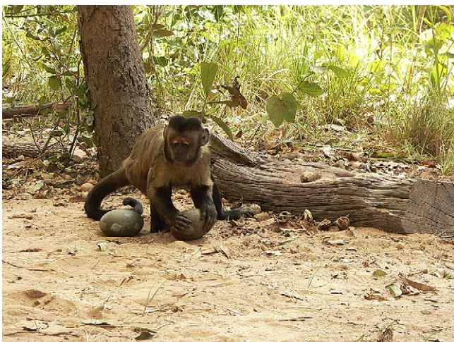
Figure 2. A monkey handling a stone prior to choosing a stone to strike the nut.

A summary of participants' choice of the heavier stone across pairs of stones of varying masses is presented in Table 8. Overall,