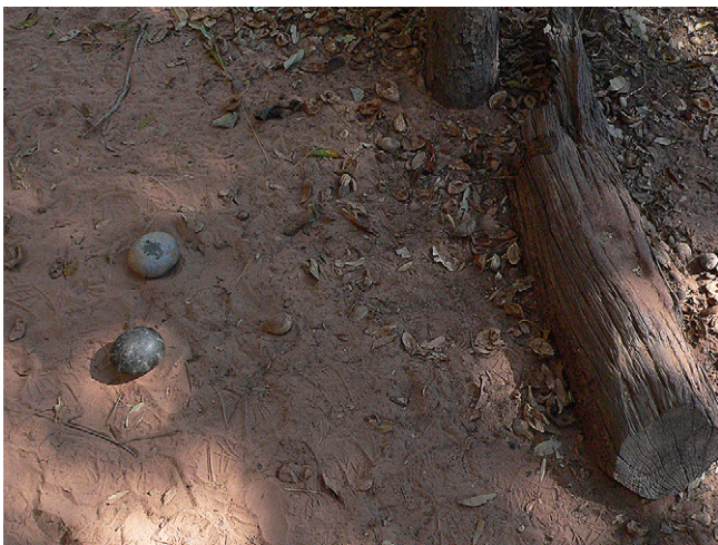
Figure 1. Experimental set-up for experiments 3–5. The two stones were placed 20 cm apart and 0.5 m in front of a log anvil commonly used by the monkeys, and one piaçava nut was placed 20 cm in front of the stones toward the anvil. The manufactured stones had equivalent volumes, shapes, and texture.

The monkeys had strong preferences for a particular kind of nut in both experiments 1 and 2. Each of the seven monkeys that participated in experiment 1 selected the tucum nut more often