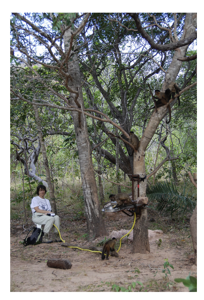
Figure 1. Capuchins' weights were obtained using a mounted scale. The scale was mounted 1 m above the ground with water and food provisioned at the distal end. An experimenter, seated a few metres away, recorded the weight showing on the digital display when one capuchin was fully supported by the scale.

If the nut did not crack on a given strike, we coded the outcome of the strike with respect to displacement as follows.