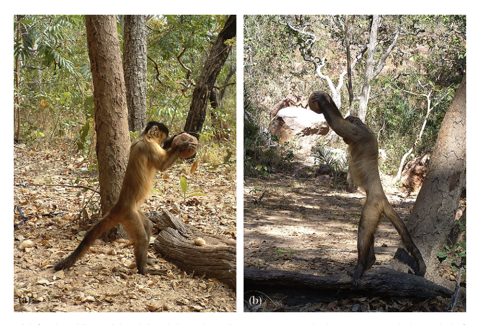
Figure 3. Illustration of (a) an adult female and (b) an adult male bearded capuchin striking a piaçava nut with a hammer stone on the log anvil. The female is standing in position 9 and the male is standing in position 12. A piaçava nut is clearly visible on the anvil in (a).

Data were collated by individual. Efficiency was calculated per individual as the number of strikes on whole nuts divided by the number of whole nuts cracked, and expressed as the number of whole nuts cracked per 100 strikes. A second efficiency score was calculated per individual in the same manner, using the number of strikes on partial nuts. We used paired t tests to compare efficiency between partial and whole nuts and Pearson correlations to