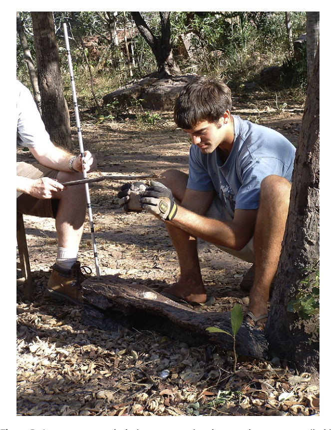
Figure 5. A young man cracked piaçava nuts using the same hammer stone (in his hands) and log anvil as the capuchins. He sat on a small log and cracked open palm nuts in varying anvil surface positions.

The person cracked nuts in a seated position using position 9 (facing the long axis of the anvil), at a self-selected distance from the anvil (see Fig. 5). He held the stone bimanually at the long axis, as the capuchins held it. An experimenter held a stick horizontally 45 cm above the anvil, which marked the limit above which the person was not to raise the hammer stone (approximately the