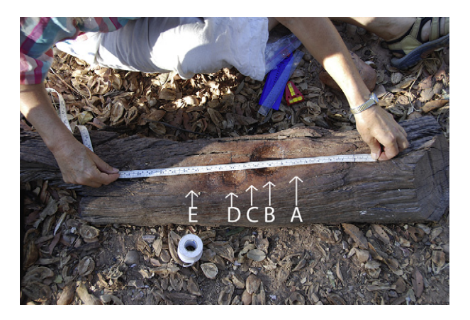
Figure 2. A view of the anvil showing two pits (D and B) and the adjacent flat surfaces (A, C, E).

(1) Fall: the nut fell within 1 m of the anvil. The capuchin had to pick it up to continue cracking, but did not necessarily have to move from its position.