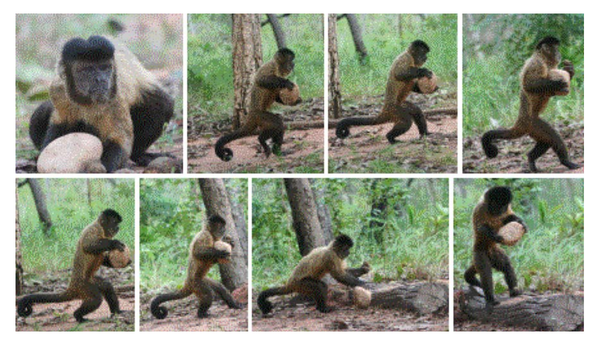
Fig. 4 An adult male transporting two palm nuts (in its left hand) and a hammer stone weighing 1,800 g to a wooden anvil. The pictures document an episode of transport observed after this data collection

If capuchins take into account the resistance of nuts when looking for a hammer, they should transport stones suitable to overcome the nuts' resistance, such as quartzites and siltstones, significantly more often than unsuitable