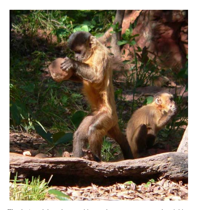
Fig. 1 An adult male capuchin monkey uses a stone tool weighing 1,800 g to crack open a nut

Here we report the estimated frequency of suitable stone/wood anvils, suitable hammers, and palms (which provide an indirect indication of availability of nuts) in different areas of the capuchins' home range (study 1). We also report direct observations of transports of stones and nuts (study 2). In this way, we test Visalberghi et al.'s (2007) hypothesis that wild capuchins transport hammers to anvil sites, and compare hammer transport and selectivity between capuchins and chimpanzees.